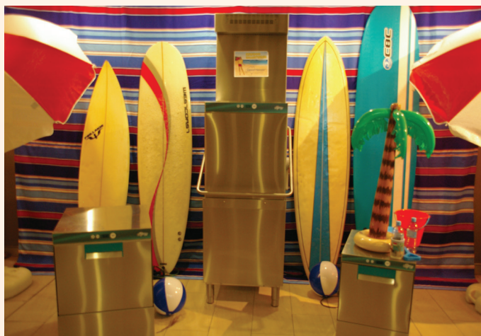
Our Smartwash Series (left to right) Smartwash 500, Smartwash 900 and Smartwash 400.

But the stars of the night were our series of Smartwash glass and dishwashers . The compact Smartwash 400 was on display, along with the Smartwash 500 and the latest model Smartwash 900. The Goldstein Eswood staff demonstrated the versatility, sustainability and reliability of each Smartwash. In particular, how the unique Heat Recovery System on the Smartwash 900 recycles energy from the steam generated by the dishwasher, which saves energy from every cycle.